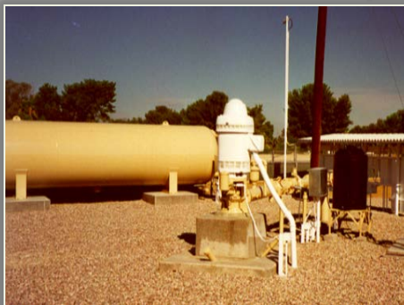
212 Production Well sites