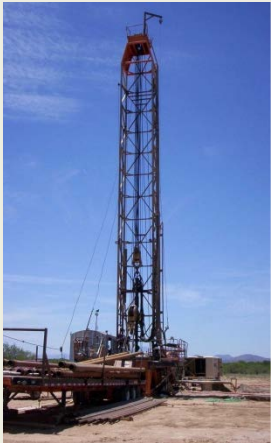
Production Well Drill Rig