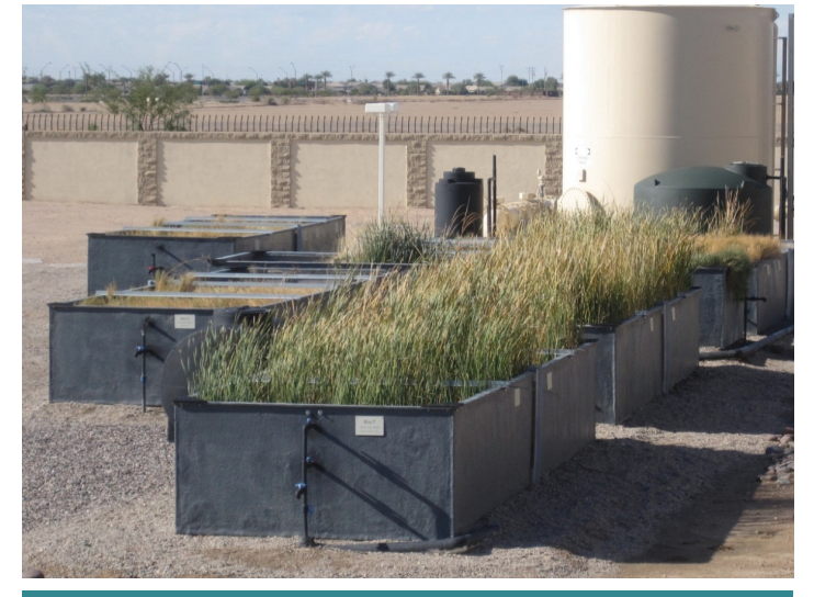
Bullard experimental concentrate management wetland

There are several strategies used by treatment plants to deal with brine. One strategy for brine stream disposal is surface water discharge into oceans, rivers, or reservoirs. This technique is better suited to coastal cities because oceans, with their comparatively larger size and high salinity level, can receive and dilute brine discharges more readily than inland bodies of water. Surface water dischargers must comply with state and federal regulations, including NPDES permitting under the