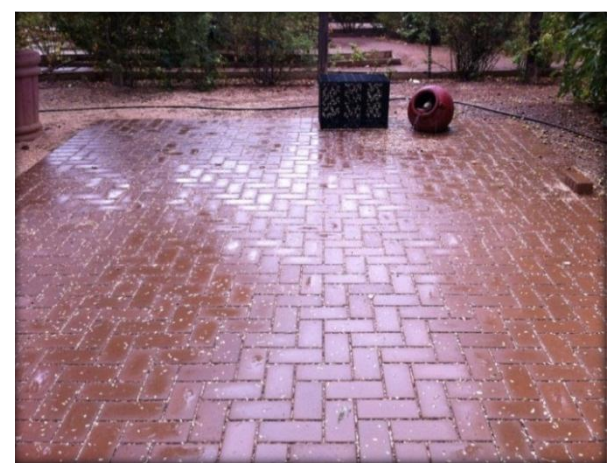
Figure 4. Permeable paver patio

Several sections of the tools were also de-emphasized based on the City's geography, climate, and local priorities. The Phoenix area has a mean annual precipitation of approximately 7 inches. On average, there are 15 distinct rainfall events annually with a measured rainfall of over 0.10 inches, about four of these which provide rainfall greater than 0.5 inches. The average rain event is approximately 0.2 inches, but nearly half of all measured events range from 0.01 - 0.09 inches. Historically, the majority of the rainfall has fallen during the winter season, when many plants are dormant or have minimal water needs. May and June are the driest months of the year, with almost no rainfall, but are also among the hottest months. In any given year, certain localized areas in the region may receive only light rain to almost no