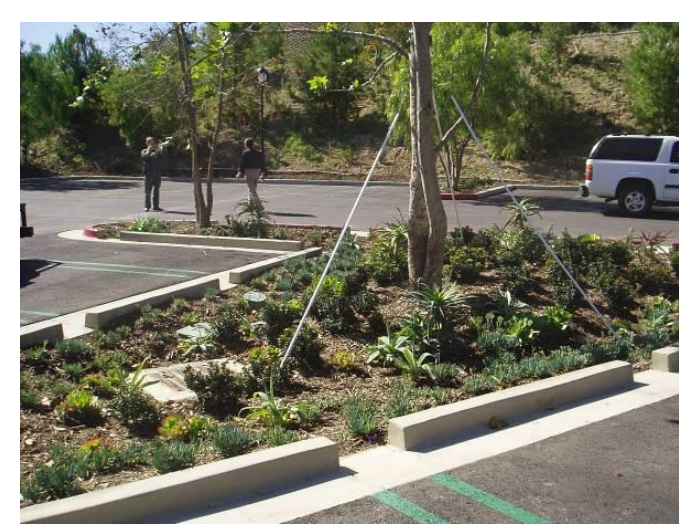
Figure 3. Parking lot runoff captured by bioretention in parking islands