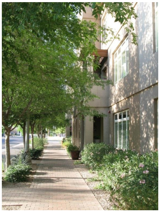
Figure 1. Trees Along 3<sup>rd</sup> Avenue and Roosevelt

Preserving trees (to provide water quality, heat island, and other triple-bottom-line benefits). (Figure 1)