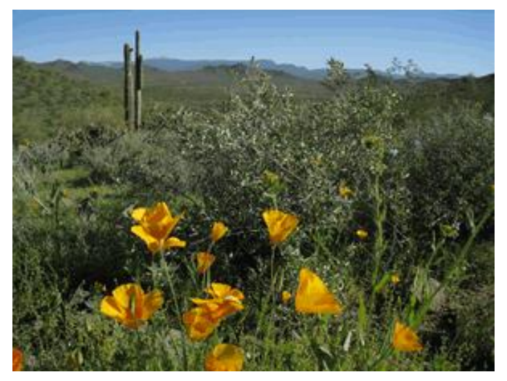
Figure 8. Example habitat conservation area for off-site mitigation