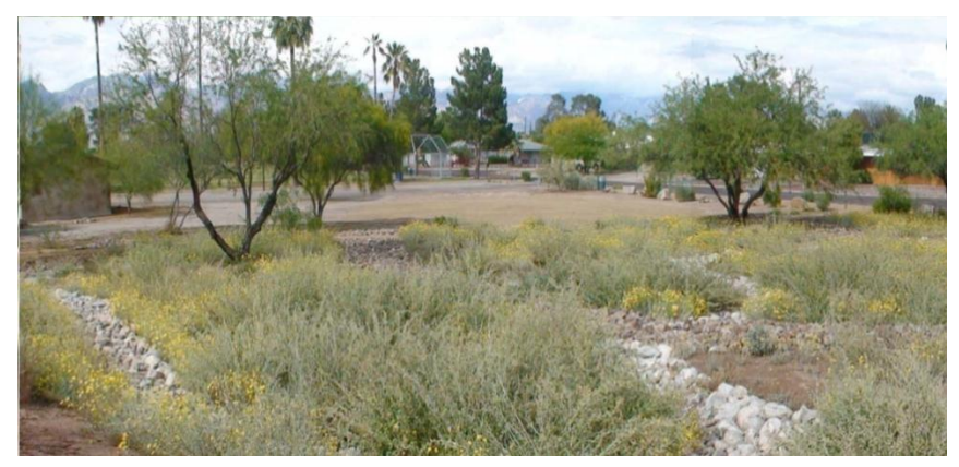
Figure 2. Retention in recreation area.