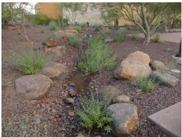
Figure 5. Water from roof directed to swale at Musical Instrument Museum