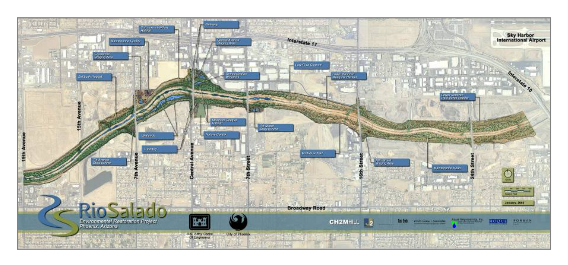
U.S. Army Corps of Engineers, City of Phoenix February, 2003

Rio Salado Environmental Restoration Project, Phoenix Reach (Interstate 10 to 19<sup>th</sup> Avenue)