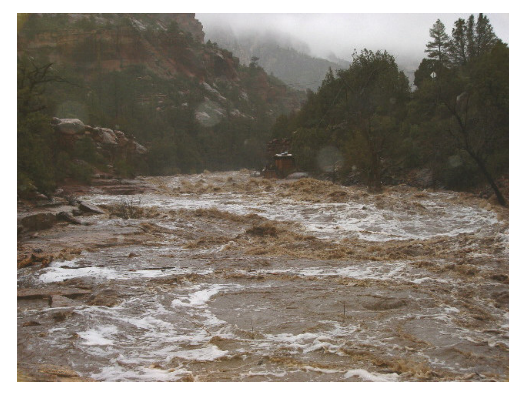
Slide Rock—December 29, 2005