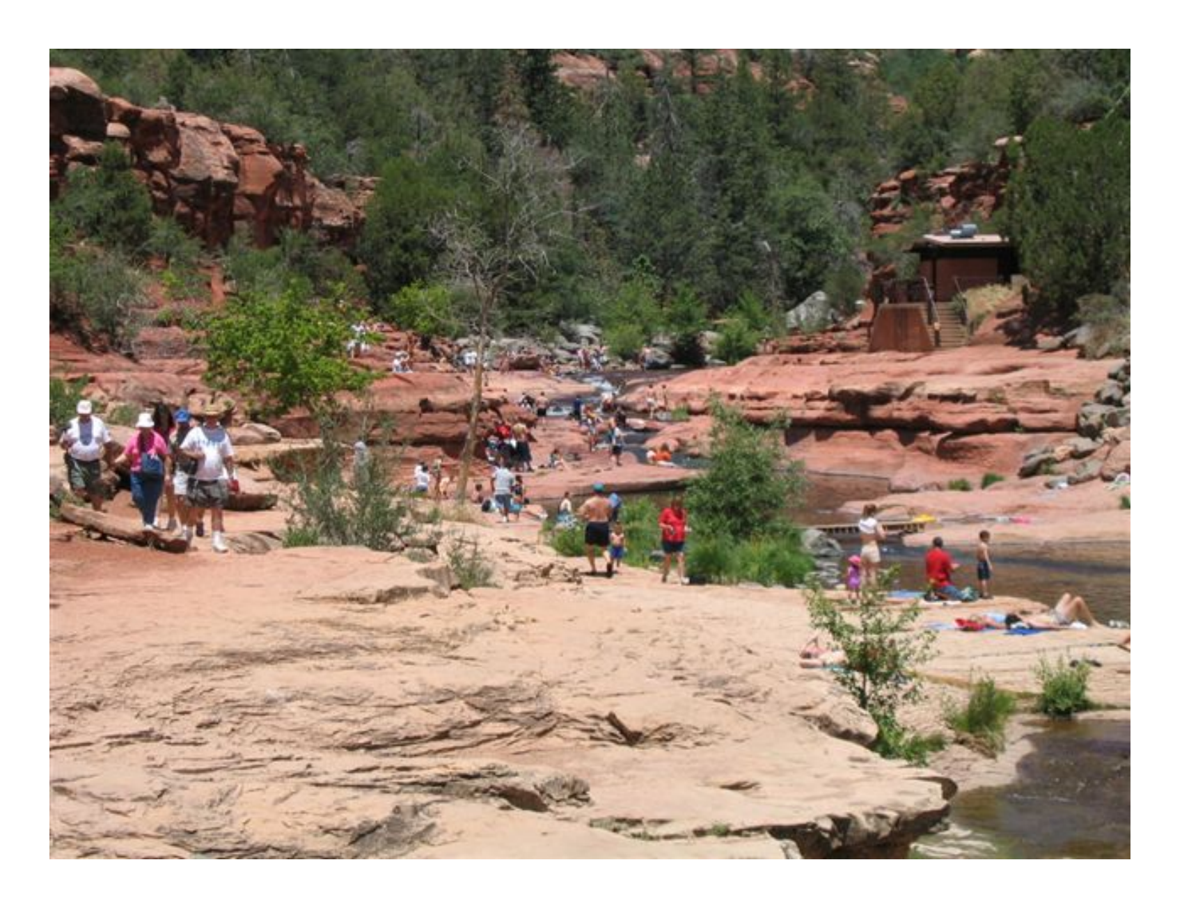
Slide Rock—Normal Summer Flows